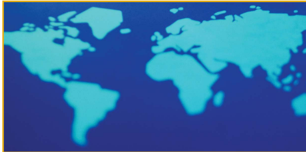
ISMA members represent businesses based all over the world.